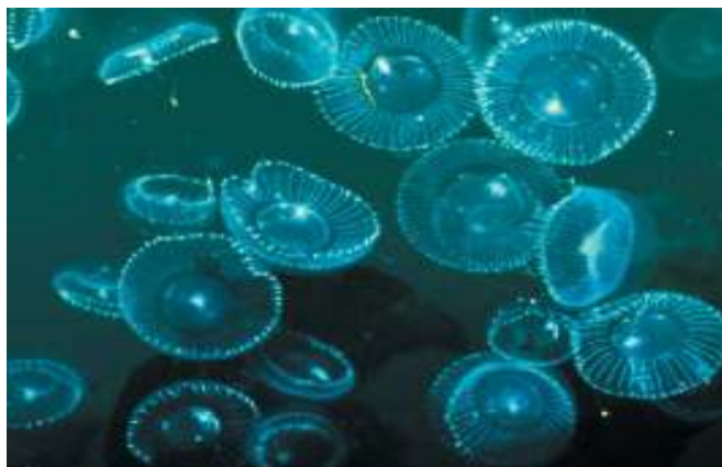
Figure 1 : The jellyfish Aequorea and its light emitting organs. Light emitting organs are located along the edge of the umbrella 3 .

The discovery of green fluorescent protein (GFP) has revolutionised research in medicine and biology (Table 1). It enables scientists to get a visual fix on how organs function, the spread of disease and the response of infected cells to treatment.