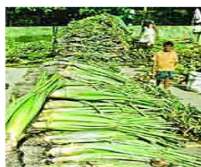
Figure 2 : 'Kochu' ( Colocassia antiquorum ) was found to contain highest AS concentration in every part of this plant (up to 158mg/kg) (recommended guideline threshold levels in food as AS is 1mg/kg)

Long time consumption of AS contaminated food may damage kidneys, liver, lungs, bladders and other major organs of humans. Contaminated foods such as rice, vegetables and meat could be an important route of exposure to AS of Bangladeshi people.