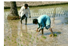
Figure 3 : Dry season rice ( Oryza sativa ) was found to contain high concentration of AS compared to wet season rice (up to 1.8mg/kg found in Bangladesh rice grain) (recommended guideline threshold levels in food as AS is 1mg/kg)

A number of measures that may be taken to reduce the risks of AS exposure to humans would be to promote cropping patterns that require less irrigation water, or breeding of rice plants that are tolerant to AS but have a limited AS uptake. Use of hyperaccumulator's plants that take up large quantities of contaminants/pollutants may be a useful, low cost, technology for the removal of toxic AS from Bangladesh soils. In this regard Chinese brake fern, Pteris vittate is extremely efficient in extracting arsenic from soils.