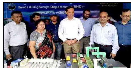
Chief Engr. inspecting RHD stall

Honb'le Prime Minister Sheikh Hasina recently inaugurated 4 th country wide Development Fair, aiming to showcase the development activities of the present government. She opened the fair via video-conference from her official residence Ganabhaban in Dhaka on 4 th October, 2018. The fair began in Dhaka and in all the district and upazil headquarters across the country with the theme "Indomitable Bangladesh on March towards Development." The fair was held in Dhaka at the field of International Trade Fair in Agargaon area. As the RHD is the forefront institution in Bangladesh in introducing E-governance and E-government procurement, all the division of RHD actively participated in the said Development Fair from 4-6 October, 2018 including RHD headquarter.