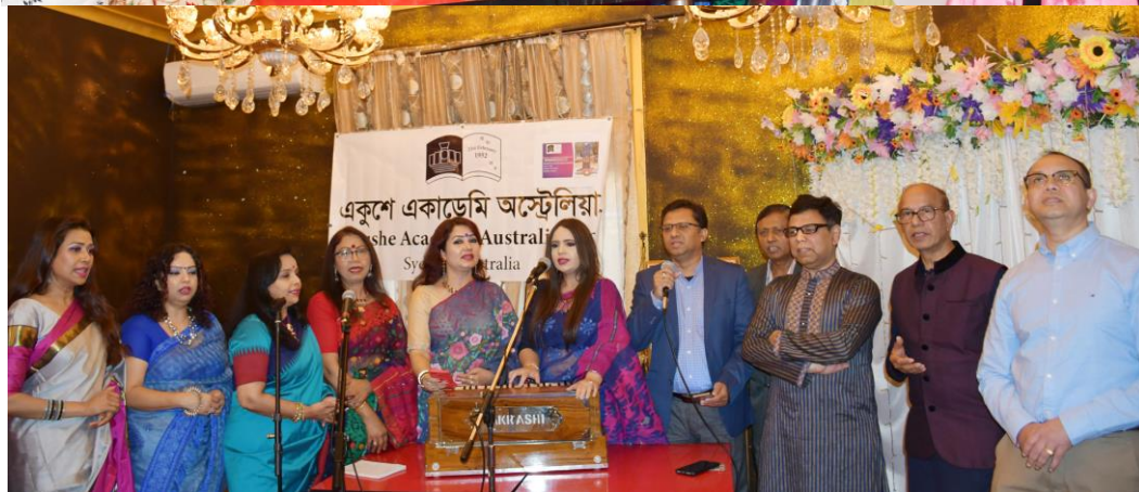
Working for Institutionalising The International Mother Language Day Concept, the 21 st February Conserve YOUR Mother Language Conserve YOUR Mother Language Conserve YOUR Mother Language